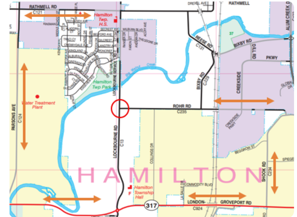
○ Project & Closure ↔ Detour Route